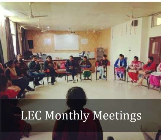
LEC Monthly Meetings