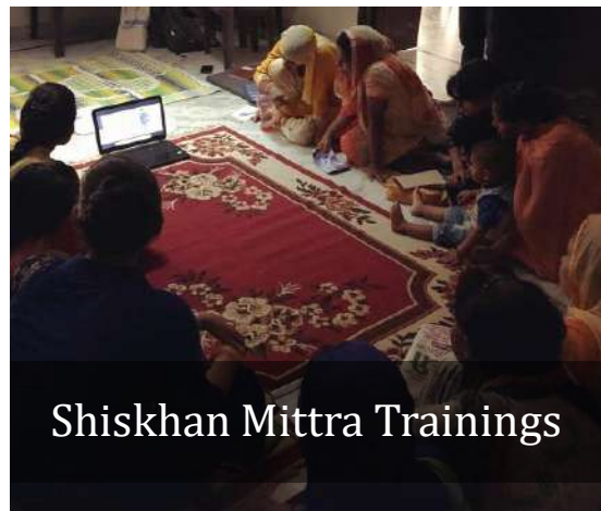
Shishkan Mittra Trainings