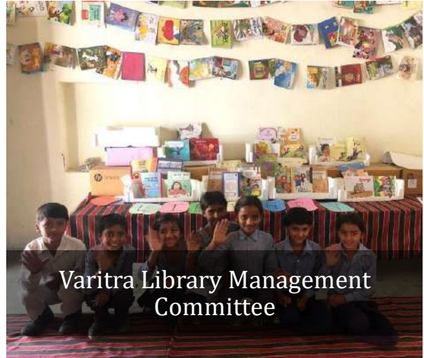
Varitra Library Management Committee