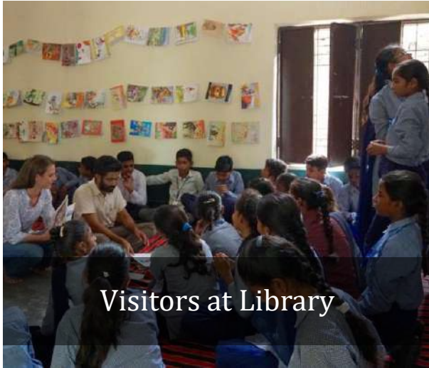
Visitors at Library