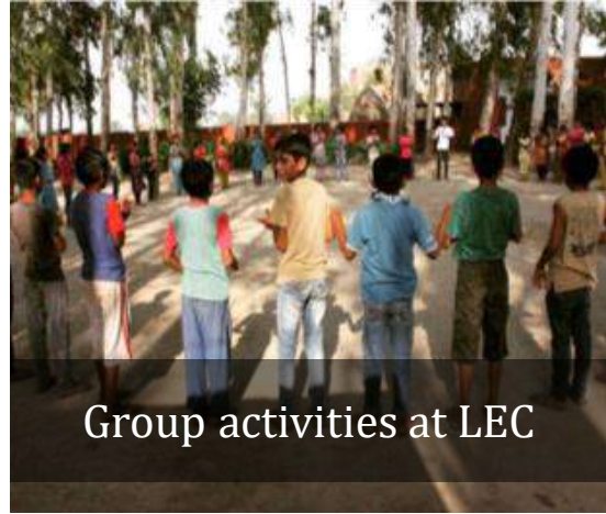
Group activities at LEC