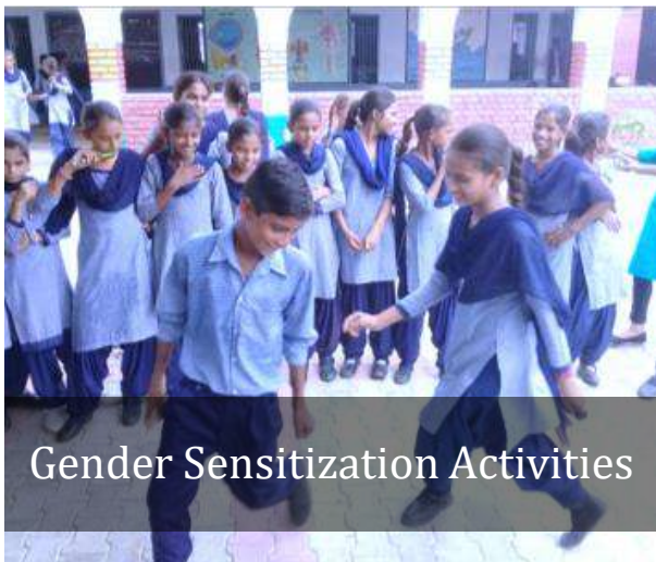
Gender Sensitization Activities