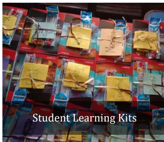
Student Learning Kits