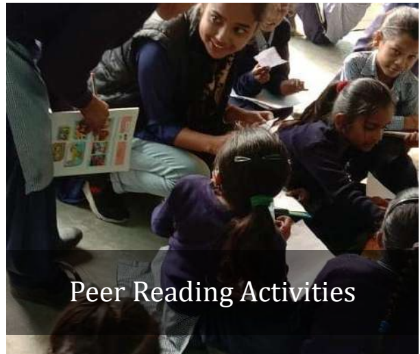
Peer Reading Activities